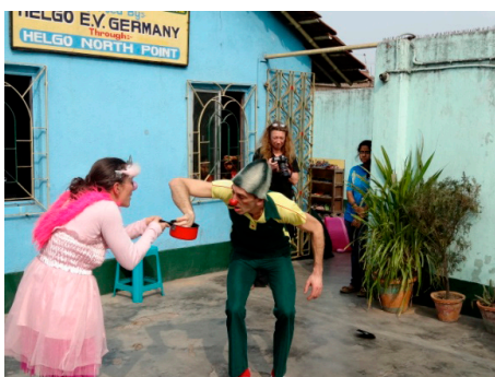
Clowns without border in Spring in Liluah

On cultural events such as concerts or shows many children always showed up to see it with their guardians. The children themselves organised a performance as well on Teachers Day and got much praise for a wonderful event at the end of the day.