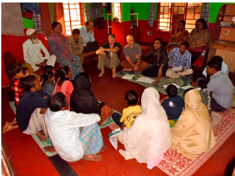
Guardians meeting with our social workers

Our social workers work closely together with the teachers and the management in order to give the children proper guidance in their daily life and to help and support them if problems occur, for instance in their families, in the school or in case of personal difficulties. The guidance and the support for our children are essential for our work as they come from extremely difficult family backgrounds. The families of our children are mostly not able to give their children proper care and guidance, due to extreme poverty, alcoholism or other drug abuse, sexual abuse or other types of violence at home, or due to death of the parents, etc.