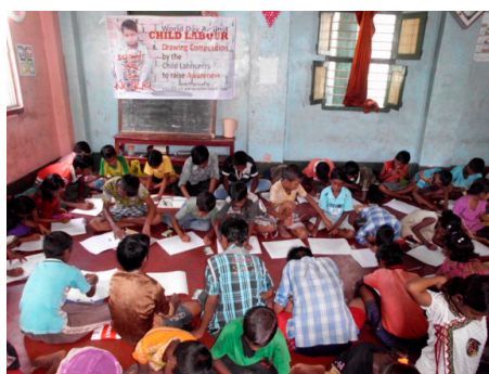
Drawing competition in our Center in Liluah