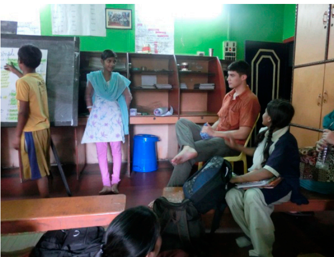
Volunteer giving a coaching class

Since 2005, German volunteers come for the period of a one year to our Project in Tikiapara and work there as part of a voluntary social service. In the last years, there were always two German volunteers who stayed together next to the Hostel and spend most of their time with the Hostel children. The Hostel children regard the volunteers as bigger brothers and do many projects with them together. The volunteers accompany the children through the day and become their mentors. They do also extra coachings, mostly in Math and English. Moreover they help the children to complete the homework, to get organised and are part of many extracurricular activities such as excursions, cooking, baking, craftwork etc. Both sides, the children and the volunteers benefit immensely from such an interaction. After one full year living closely together in strong relationships it is always very difficult for either side to say goodbye to each other.