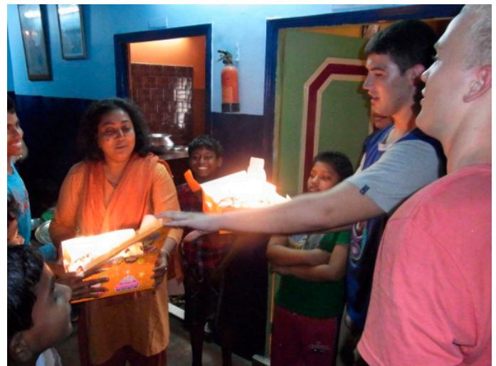
Celebration of a Birthday of a Hostel boy with the German volunteers and a social worker