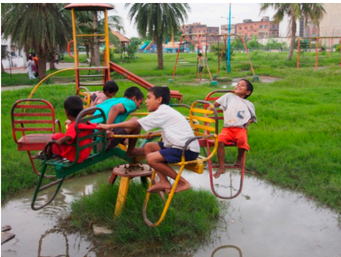
Hostel children playing in Belilious Park during their regular visit three times a week.

As all other children, the Hostel boys take part in the routine of the coaching classes but receive moreover extra help and enjoy extra activities and facilities which most of the other Project-children, who stay with their parents at home, do not get. Among the Hostel children there is a friendly atmosphere and they support and care each other like brothers. In general, the Hostel gives the children the necessary environment for education and development.