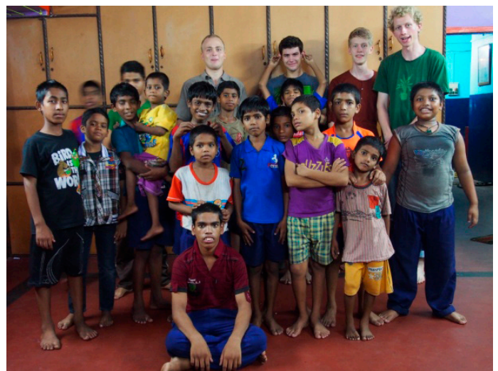
Group photo of the Hostel children with the two former and the two coming volunteers at the beginning of August