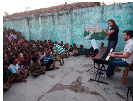
Keys of Change in November in Liluah