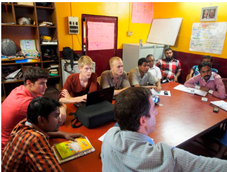
Weekly Tuesday Meetings