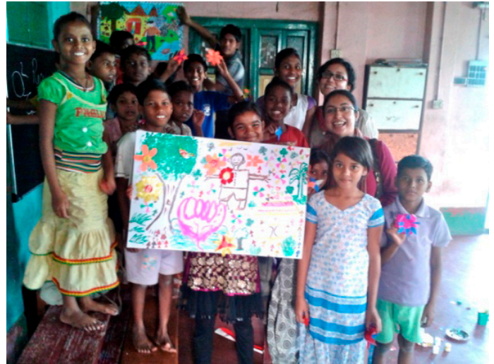
One of our regular workshops on craftwork in Liluah.