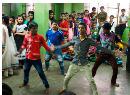
Performance on Teachers Day