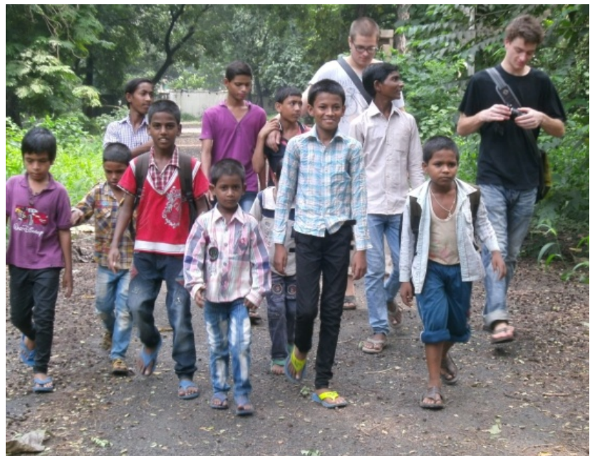
The Hostel Children on a boat's trip and during a visit of the Botanical Garden with the German Volunteers