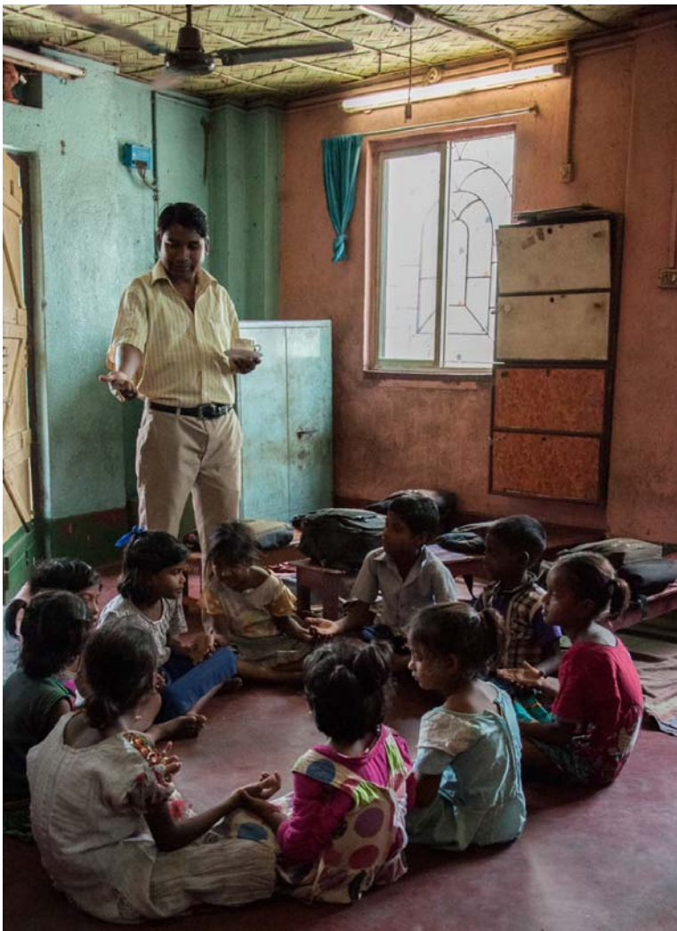
Age specific learning: smaller children in our daily General-Coaching

During the year 2014, most of our English Medium students attended Samaritan School ( www.samaritanhelpmission.org ), a school for the underprivileged children in Tikiapara, Howrah. Two other students went to another English Medium School next to our Day Care Center, named Sacred Heart School. Most of them performed well and with enthusiasm. They enjoyed the opportunity to go to school and even more to join the coaching classes of the H.E.L.G.O. – Project, where special attention is taken to every child. “No child is left behind” is a motto we try our best to implement. Given the poor and mostly illiterate family background of the children, this is not an easy aim to reach. But in comparison to the years before, we can proudly say, that a lot of improvement has been implemented and that our children nowadays benefit from the education, offered to them in the schools much more than in the past. This is also the result of a close co-operation between the schools and the management as well as the teachers and the social workers of the H.E.L.G.O.-Project.