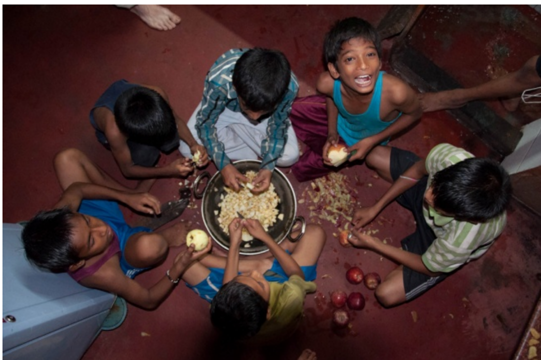
Hostel children helping in the kitchen