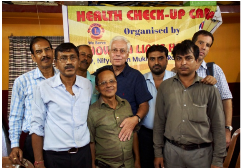
Health Check-up (HIV, TB) of all our children in Tikiapara and Liluah, organized and done by the Howrah Lions Hospital in September