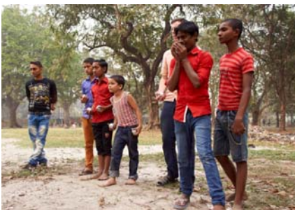
Hostel Children on one of our Picnics, at Park Circus Maidan in December