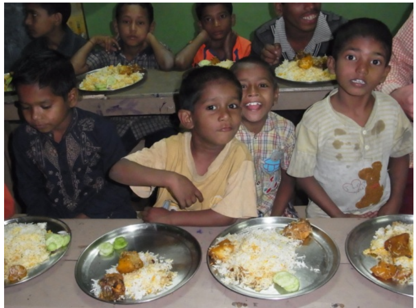
Cooking workshop and dinner in the Hostel