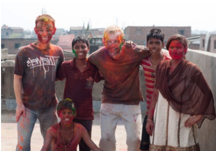
Children and Volunteers playing Holi in March