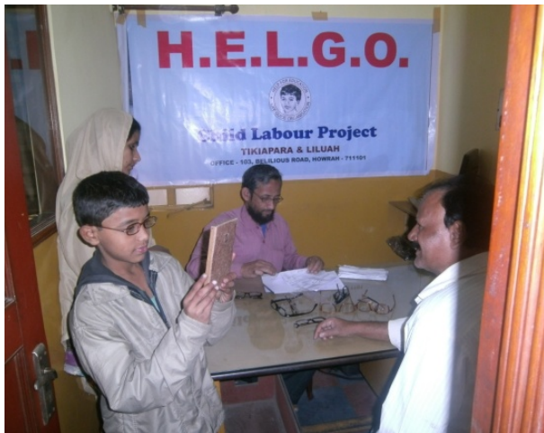
Eye Check up in co-operation with Bengal Service Society