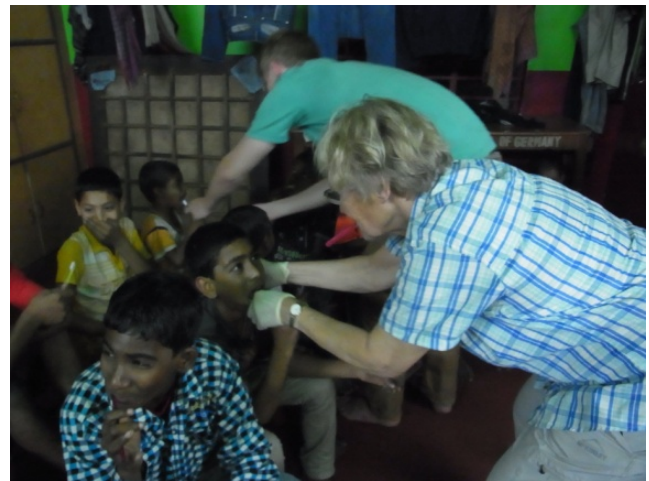
A dentist from German showing how to Brush one's teeth properly