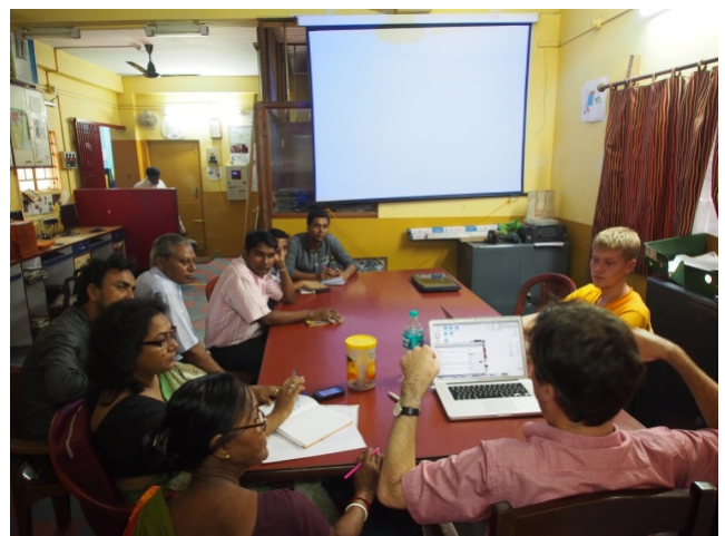
Weekly meeting with all Social Field Workers to discuss their work