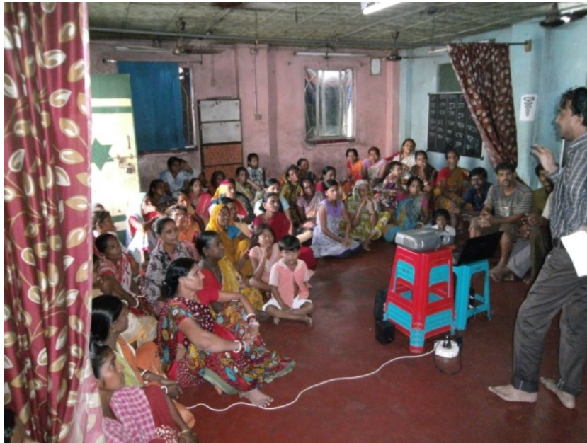
One of our monthly Guardians Meeting in the Center in Liluah, Belgachia, with an awareness program on awareness