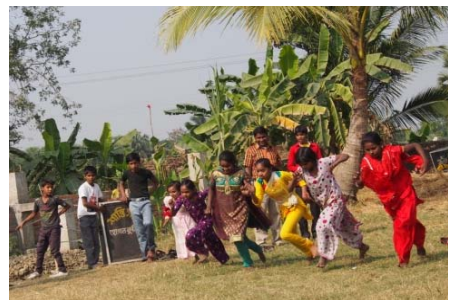
Picnic and Competitions with children of Bengal Service Society, December