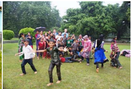
A visit of the Zoological Garden Alipore in September