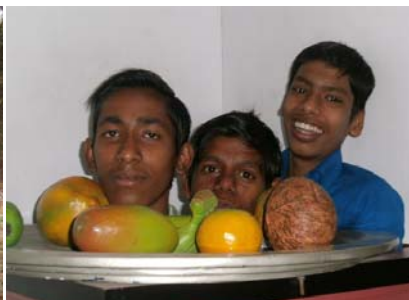
During a visit to Science City in December