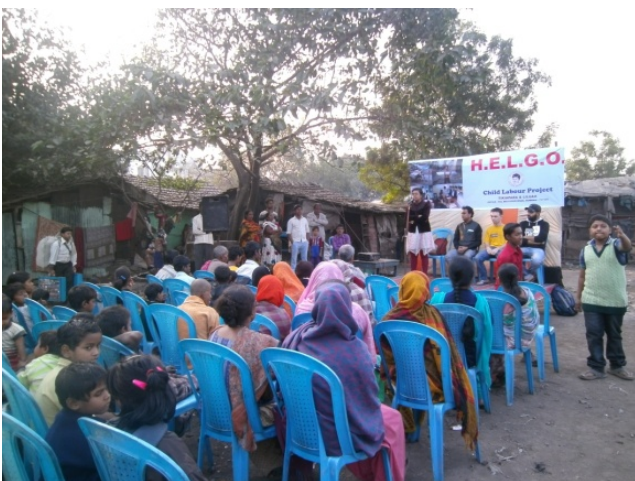
An Educational Awareness -Program at Tikiapara By Pass, held in December

Another important pillar of our work for the poor is the part taken over by our social workers which stay in close contact with the Project children and their families. Their job is to investigate the family background, to stay in close contact with children and families, to support especially the children and their mothers through counseling, to keep the official record updated and to assist the guardians. In order to improve the level of social work as well, different methods of social work have been introduced to our team of social workers. Over the year 2014 several professional social workers from Germany have been visiting our Project to give a number of workshops on new methods of social work, e.g. how to make a Genogramme, how to use the techniques and tools of Systemic Thinking for a better understanding of processes in the relations within a family or how to use the technique of Family Constellations. All these methods were introduced and practically trained with the staff in order to enable them to use helpful and meaningful tools, to gain a deeper insight in the relationships between the family members and, as a result to be able to offer helpful counseling and social support to those in need.