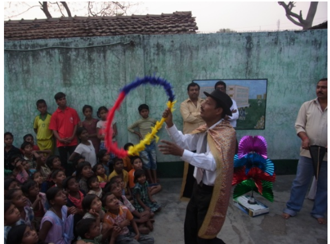
A magician from Kolkata made the children's eyes glister during his performance in our center in Liluah in March.